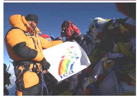
CO-OP MONTH | OCTOBER 2018