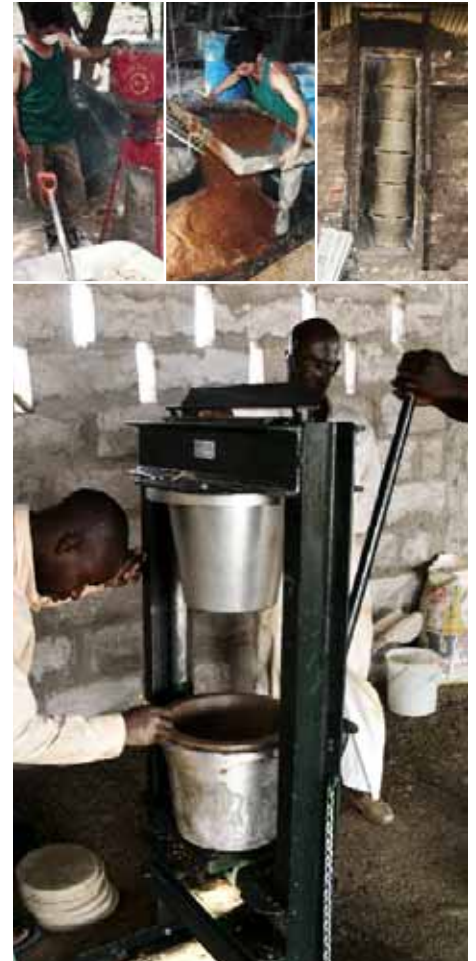
PARTES PRINCIPALES DE LA PRENSA PARA FABRICACION DE FILTROS

Depending on the weather, the fresh filters are left to dry for a period of between 5 and 21 days. Nicaragua has special drying rooms where they can be dried in four days throughout the year. Once the