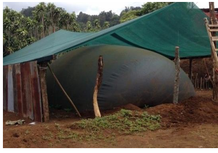
Evaluación de efluente de biodigestor como fertilizante orgánico en el cultivo de maíz