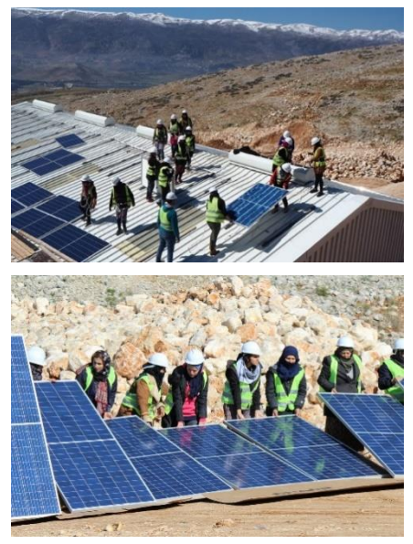
The Switchers Support Programme Regional and National Scaling Up Roadmaps